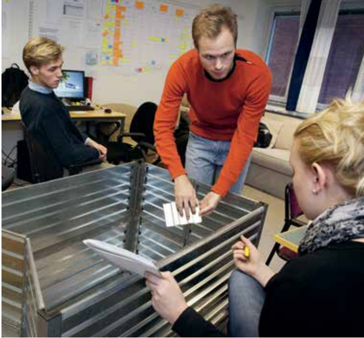
Students working on their prototype, Integrated Product Development.

ing supports idea generation, conceptualisation, design exploration, evaluation, communication, and construction. Because it can be an overwhelming undertaking to create a single prototype that strives to achieve all of these goals, it is important to be focused on the objectives. From an educational viewpoint, achieving learning objectives overshadows the importance of technical performance, even though they tend to go hand in hand.” (32)