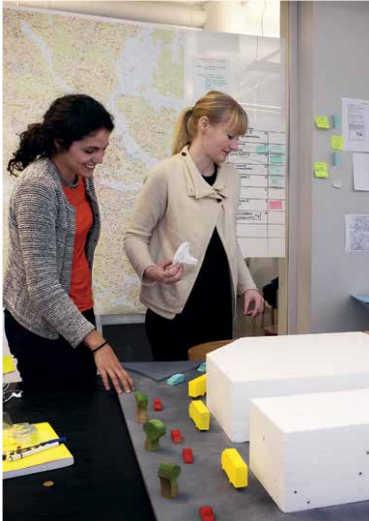
Students working on solving the problem with traffic and congestion, OpenLab.

Suggestion: There is a variation in the courses described regarding whether they have ill-defined and open ended real-world problems or clearly defined assignments for the students to work on and whether the projects are formulated by teachers or by external partners or industry. Prior to deciding upon the challenge/project task, start with