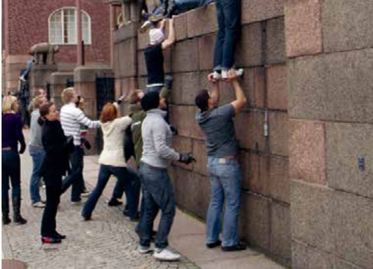
Team-building and ice-breaking activity in Integrated product development. The student teams are asked to make sure the whole team gets from one side of the wall to the other, by climbing over it. No student can climb the wall on his/her own. By this, the teachers are aiming at helping the students to start trusting and helping each other.

signs for storms, or upcoming storms. Drops are when productivity or quality goes down. Plops are when you notice deadly silence in response to someone's ideas. This can cut off creativity from the group; reasons for it could include some students just wanting to get on with the work, or not all students feeling they belong to the team. When students have hurt feelings or frustration over, for instance, the project task, the team, or their own role in the team, you might experience a pinch here and there. Pinches can be formulated in sarcastic sentences, or shown with body language. When you as a coach notice a pinch, it's best to mention it. Otherwise it can blow up to a crunch where students leave a team, refuse to solve the task and so on. (26)