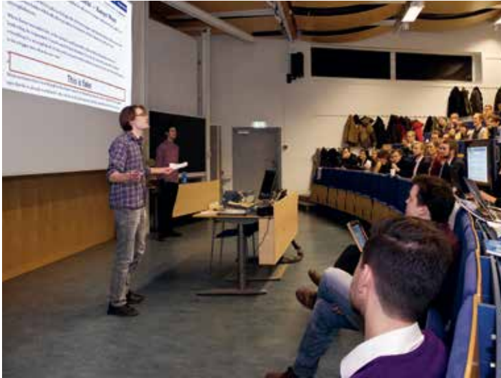
Students performing their final presentation, Future of Media.

when talking in front of different target groups. These aspects can also be a basis for the feedback and assessment criteria within your course.