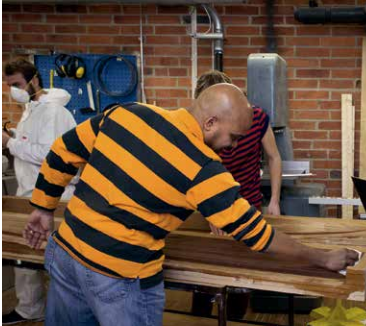
Students working on developing the solar powered boat.

Japanese students and for finding a sponsor to finance their journey to Japan in August.