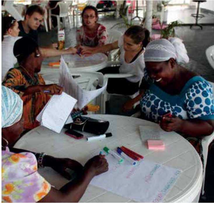
A group working on a sanitation project in Keko Manchungwa together with students from Aalto University.

with the community group to find solutions, coming up with a theme for a dry toilet as the basis for a sanitation business.