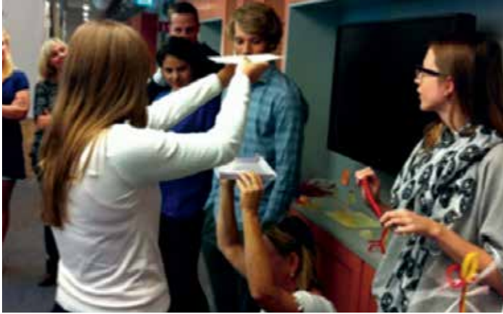
One of the groups pitching their solution in the exercise Rapid Prototyping, OpenLab.