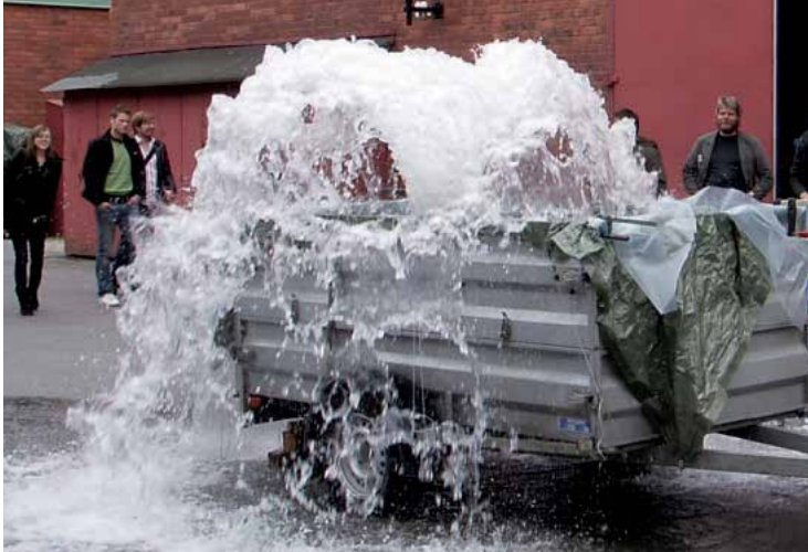
Flood pump (120 litres/s) developed by students, Integrated Product Development.

The pumps must also be able to be moved into place very quickly when they are needed. Therefore they must be available already before the flooding occurs, perhaps placed in a store cupboard or shed. They must also be sufficiently small to be able to be carried to and lowered into a drain. Finally the pump must have the capacity to pump very dirty water at high speed without breaking down.