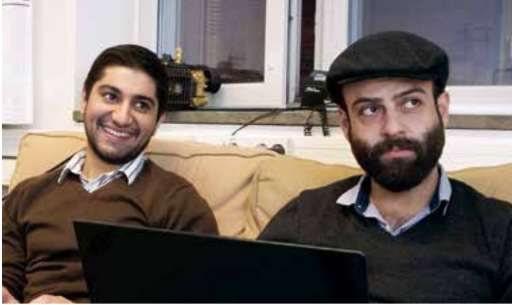
Students working in their team, Integrated Product Development.

to create an effective team. To make the team as effective as possible, all roles should be taken. However, one team member can have more than one role and an effective team should have at least four or five members. (24)