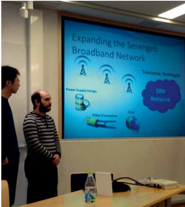
Midterm workshop with peer feedback in Communication Systems Design.

Points raised are the project plan, work packages, division of labour in the group, time commitment, technical documents etc. To be able to give fruitful feedback, they have, in addition to reading all the documentation, also interviewed members of the other team. Further to this there are teachers from the department attending the midterm workshop and they also have the opportunity to give feedback to the project teams.