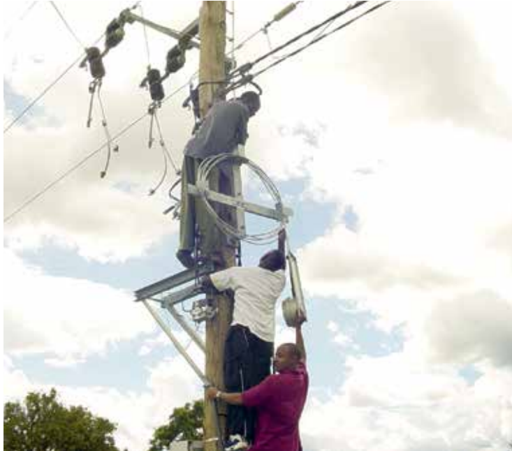
Installation of solar-powered router in Tanzania, Photo: Björn Pehrson

been the muscle that has delivered the project. Working on the projects has developed the students to a remarkable degree. They often report that course was the one where they really learned something of value, for example that it pays to work together and how to put this into practice.